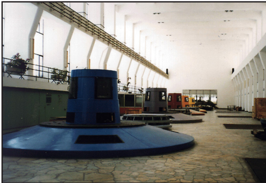
Reduce equipment reliability